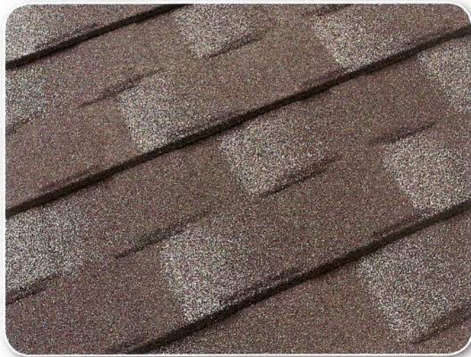
* picture of Metrotile Viksen tiles in standard colour Torino

The inspiration for the Viksen Metrotile is to be found in the uniqueness of the ancient Viking architectural style. Used in building construction, their homes and other edifices were built entirely from wood, onto which small roof shingles were then applied extensively.